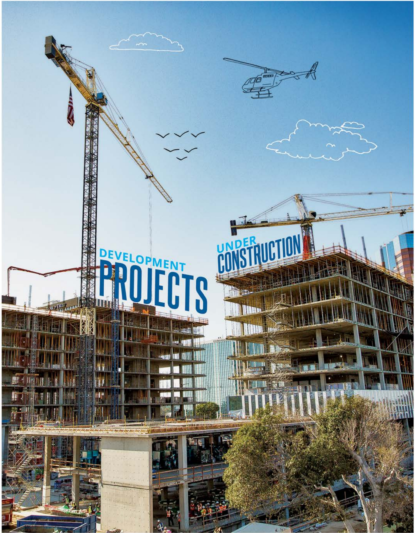
LONG BEACH CIVIC CENTER