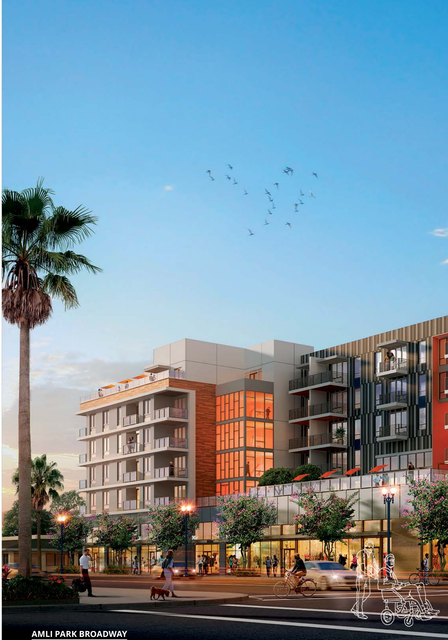
AMLI PARK BROADWAY