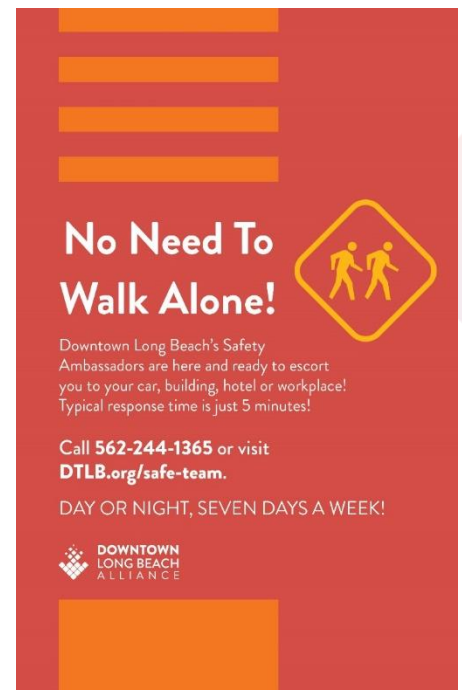
Option B (40% support)