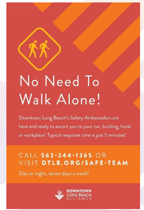
Option C (60% support)