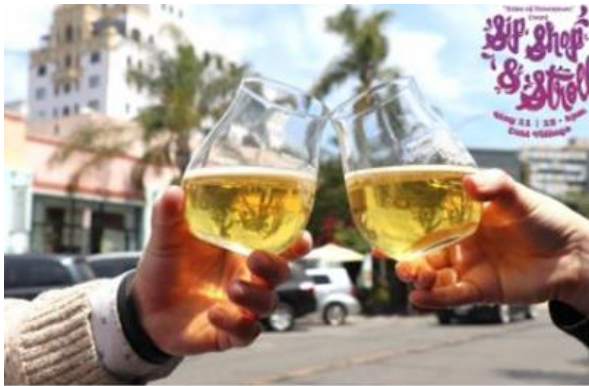
Celebrate 15 Years of Flavor: Sip, Shop & Stroll Through the East Village

Apr 24, 2024 | Downtown Scene Newsletter , Events