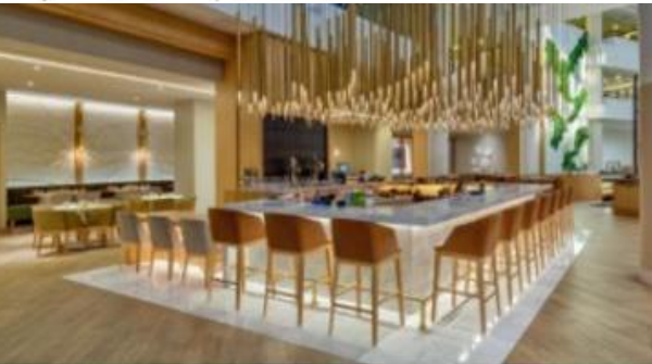
Pit Stop Perfection: Navigate DTLB's Premiere Hotel Bars for Race Day

Apr 17, 2024 | Downtown Scene Newsletter , Events , News