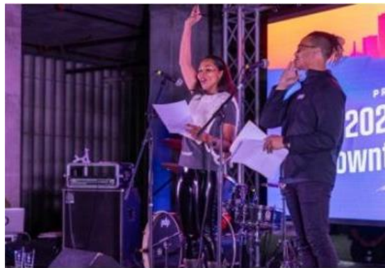
Visionaries Transforming DTLB: Spirit of Downtown Award Winners!

Apr 24, 2024 | Downtown Scene Newsletter , Events