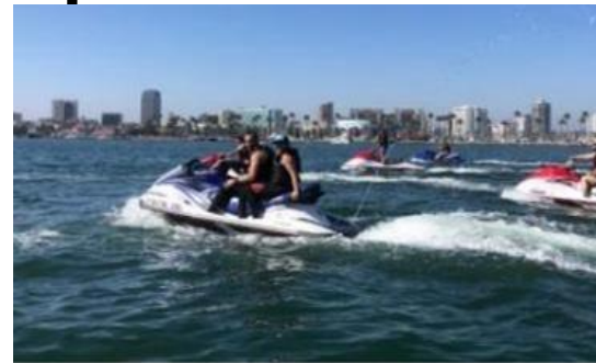
Beyond the Track: Discover Long Beach's Hidden Gems During Grand Prix Race Weekend

Apr 24, 2024 | Downtown Scene Newsletter , Events , News