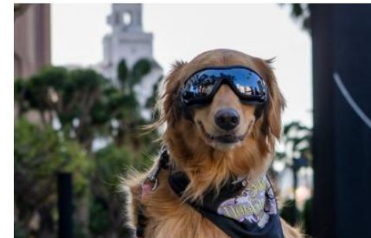
Paws-itively Heartwarming: Inside the Lives of Downtown's Pet-Loving Community