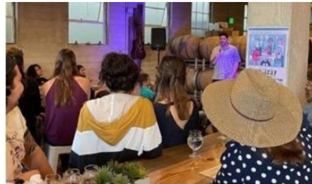
Cheers to Comedy & Karaoke: Downtown's Best Spots to LOL and Sing Your Heart Out!

Apr 23, 2024 | Clean and Safe , Downtown Scene Newsletter , Events , News