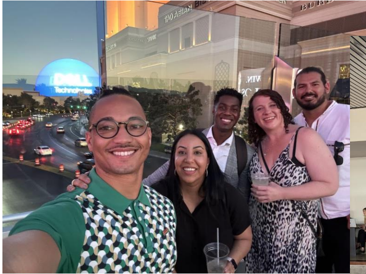
International Council of Shopping Centers (ICSC), Las Vegas

3A. Moving to Reminder email - sent Monday prior to meeting Staff Report